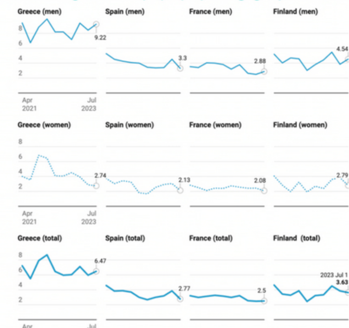
Figure 8. Percentage of self-employed people in age group 15-24 (2021-2023)

Our Territorial Analysis, led by UPNA, makes evident there is an urgent need in our territories to foster entrepreneurship among the young population. The evident gender disparity in youth entrepreneurship highlights a crucial aspect that TEAMIT+ should proactively incorporate into its strategies and initiatives. Addressing this gender gap is in line with the project's dedication to cultivating inclusive and diverse entrepreneurial ecosystems. Within TEAMIT+ we aim at fighting the lack of awareness and knowledge about the different types of entrepreneurship, which may be more attractive to young women. Entrepreneurial training in the Territorial Analysis of TEAMIT+ Consortium.